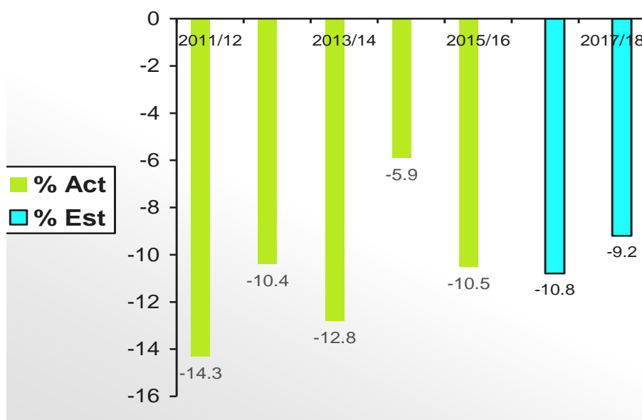
Percentage Change in Government Grants (Actual and Predicted)

The chart below shows the percentage decrease in the funding settlement for the last few years on a like for like basis, despite steadily increasing demands on services mainly due to demographic changes. Reductions for the final two years are estimates and include business rates income forecasts together with assumed government grant cuts.